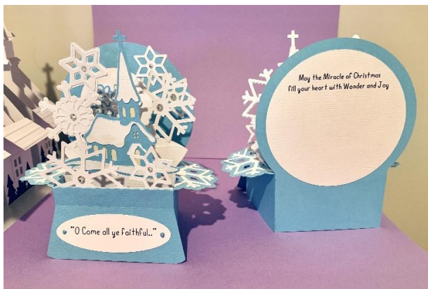
Cards will be available for purchase at the Arts & Crafts Marketplace this year. These are samples of more than 10 different hand made cards and items to be sold on November 6th. Quantities are limited, and there will be no additional sales this year.