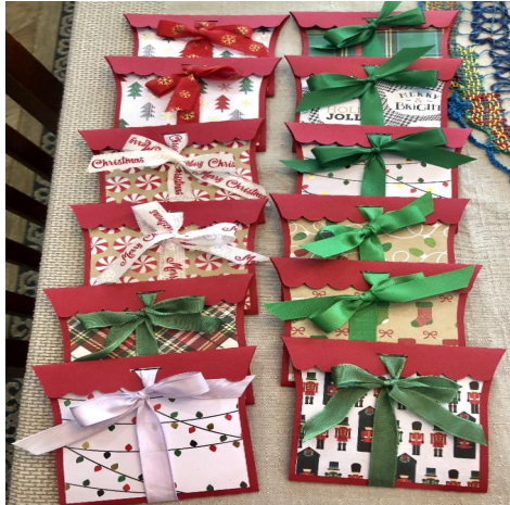
These are gift card envelopes, 24 available.